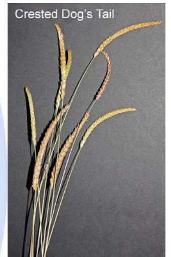
Crested Dog's Tail